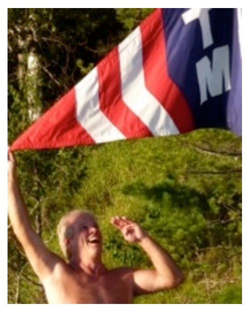
Rear Admiral Dick Staunton oversees our committee boat operations.